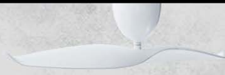
2-Blade Model: AE2