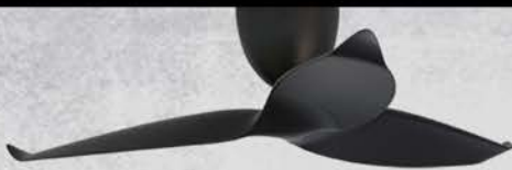
3-Blade Model: AE3